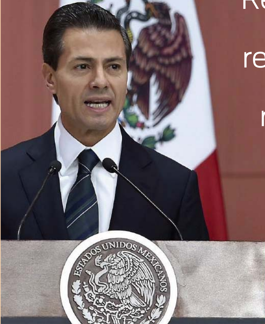
Mexico's President Enrique Peña Nieto